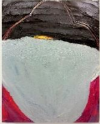
All in Good Time , 2017