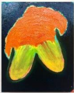
Biped , 2017