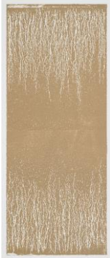
Tide on the turn , 2018