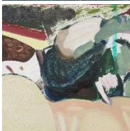
Breaking News , 2018