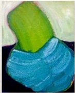
Seeding , 2017