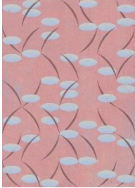
accio , 2019 acrylic on paper 29.7 x 21 cm £800