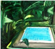
Swimming in Jungle , 2016