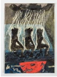
Waiting , 2018

watercolour, ink, pastel and charcoal on paper