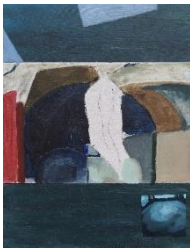
Keeping In Touch , 2018