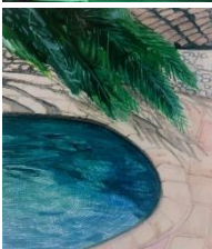
Curve , 2017