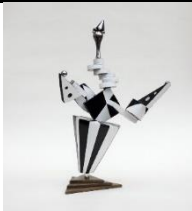
Heptaquin , 2019

painted stainless steel, brass 36 x 18 x 23 cm £3,200