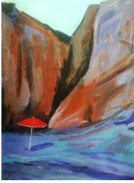
Reserved , 2018