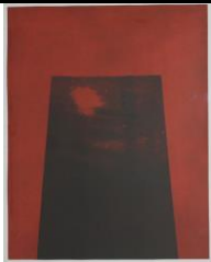
Three studies for Here They Rise, Declining , 2018 black monotype and etched background on Somerset paper edition 2/2 each 54 x 74.2 cm £825