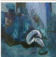
(Ctrl + F) , 2018