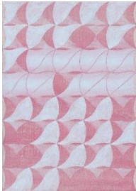
ho:nt , 2018 acrylic on paper 29.7 x 21 cm £800