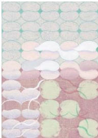
i-i , 2018 acrylic on paper 29.7 x 21 cm £800