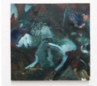
Untitled , 2019